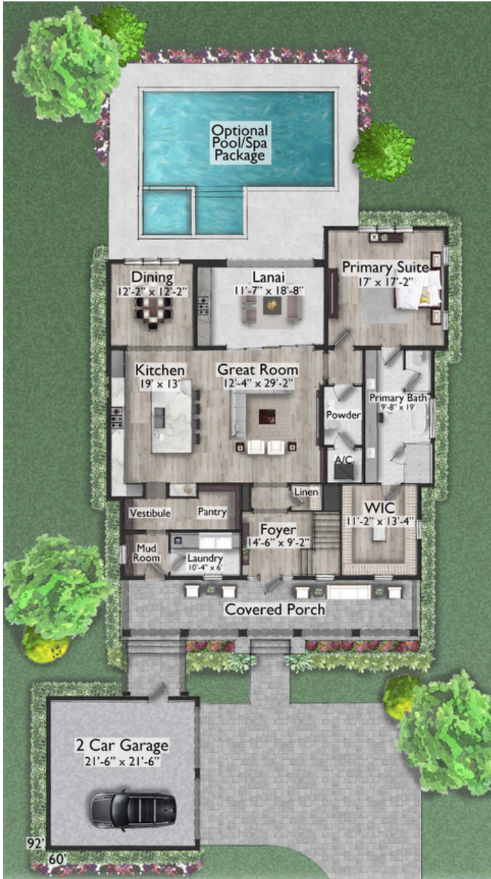
FIRST FLOOR (2,133 SF)